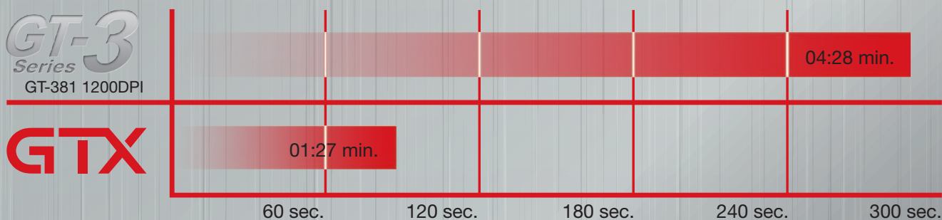
Image size approx. 32cm x 22cm cmym only

Image size approx. 32cm x 22cm cmym+w print